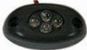
EB/4= Ellipsoid in Black with 4 LED