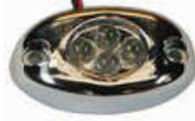
EC/4=Ellipsoid in Chrome with 4 LED