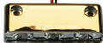
RC/3=Rectangle in Chrome with 3 LED