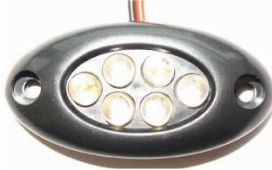
EC/4=Ellipsoid in Chrome with 6 LED